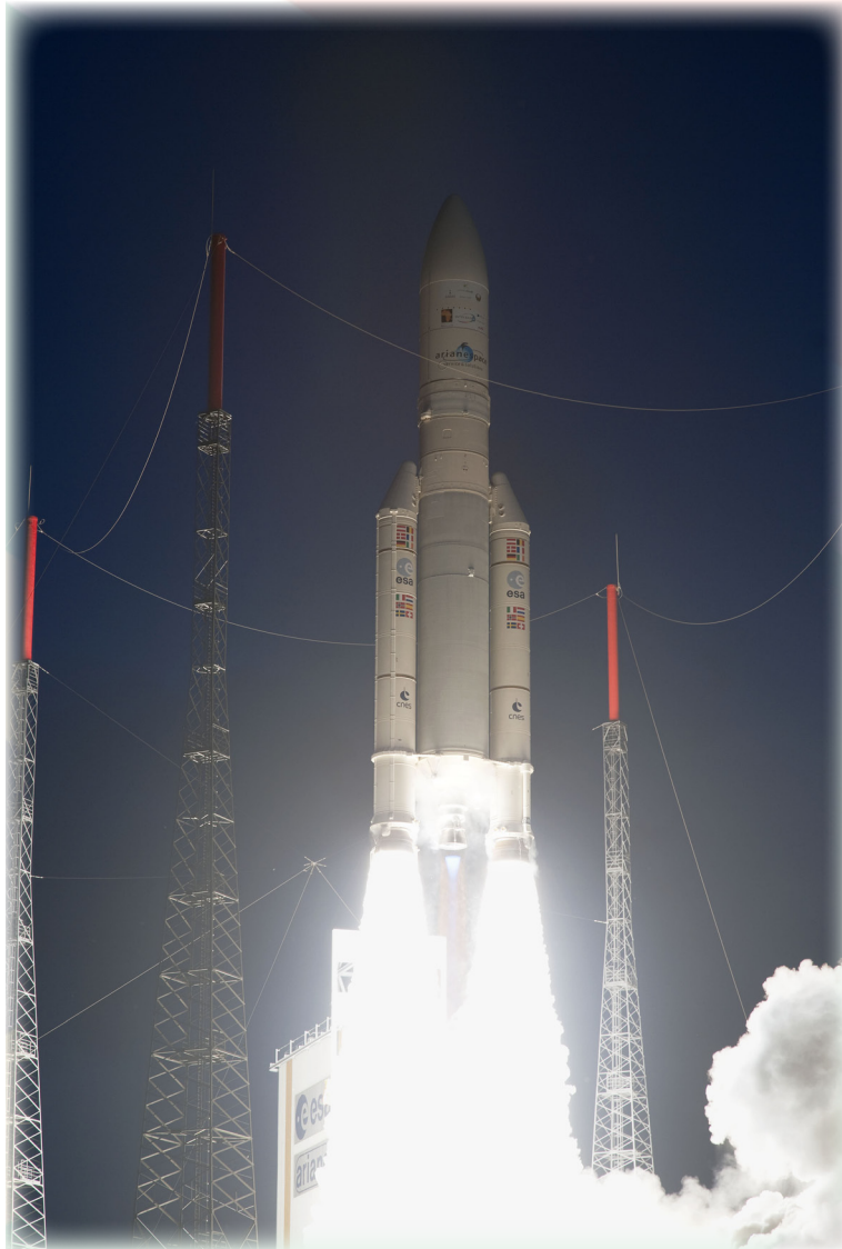
New Dawn Satellite Launching

space transportation. South Africa is also the home of a pioneering participant in commercial space tourism. Mark Shuttleworth, an Internet entrepreneur, became the first South African in space in April of 2002. 52 His trip to the International Space Station, launched via Soyuz and brokered by Space Adventures, cost a reported 20 m USD (ZAR 143.4 m, 14.4 m EUR). 53